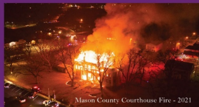
Mason County Courthouse Fire - 2021

Your generous donation is tax-deductible. Our 501(c)(3) Tax ID is XXXXXXXX