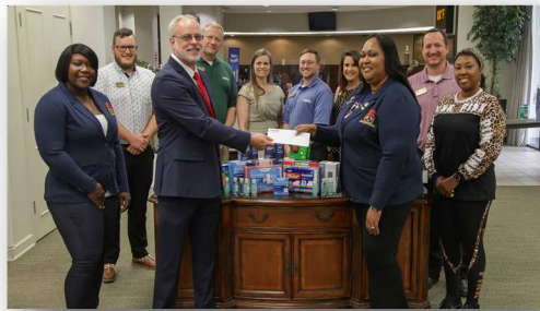
Technology Division Selected Black Nurses Rock Longview Financial Gift + Purchase of PPE Items