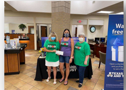
The Forney Branch Team Selected Forney Food Pantry Financial Gift to restock food pantry for meals as well as household items and school supplies