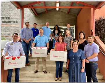
Main Bank Lending Selected Boys & Girls Clubs of the Big Pines Financial Gift + Purchase of Lunches for Kids' Summer Program

[SUMMARY] The year 2020 will forever be remembered for the profound and significant challenges faced by so many friends, neighbors, and loved ones. In unprecedented fashion, a perfect storm arose in the summer of this historic year as our nation simultaneously faced a health crisis, an economic crisis, and a crisis relating to racial equality and justice. It was a time marked by incredible hardship, heartache, pain, and sorrow. In an effort to bring help and healing, resilience and recovery to the communities we serve, the executive leaders of Texas Bank and Trust challenged their bank family to provide the hands of hope throughout the bank's markets during this incredible time. The 480 officers and employees of TBT were asked to distribute $100,000 in charitable gifts in just 25 days as a show of tangible support to organizations and initiatives addressing the unprecedented challenges of the moment. In the end, more than 75 unique organizations, overseeing 81 different critical care programs and/or initiatives, were touched by Texas Bank and Trust staff members' Healing Hands .